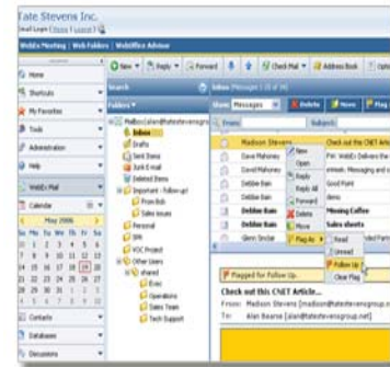
WebEx Mail gives you a desktop-like experience with advanced features - on the web. It's business-class email done right.

WebEx Mail makes it easy to manage mailboxes from anywhere. Create & delete mailboxes, distribution lists & groups, configure shared folders, assign global spam settings, block lists, and much more.